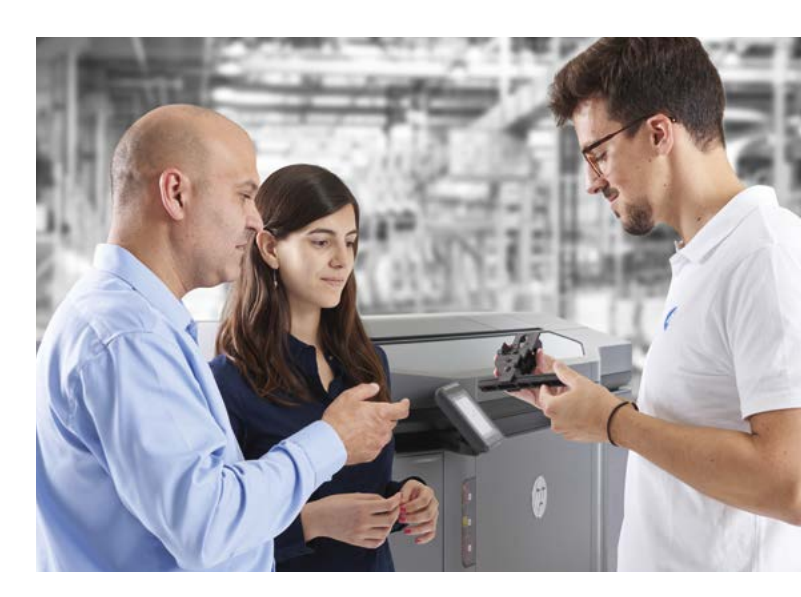
Learn more at hp.com/go/3DSupport

Accelerate your transformation with HP 3D Printing Grow Services , designed to help you grow, move into new materials, applications, and use cases, and further optimize your manufacturing processes.